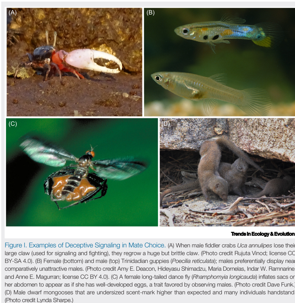
Figure 1. Examples of Deceptive Signaling in Mate Choice. (A) When male fiddler crabs Uca annulipes lose their large claw (used for signaling and fighting), they regrow a huge but brittle claw. (B) Female (bottom) and male (top) Trinidadian guppies ( Poecilia reticulata ); males preferentially display near comparatively unattractive males. (C) A female long-tailed dance fly ( Rhizophomyia longicauda ) inflates sacs on her abdomen to appear as if she has well-developed eggs, a trait favored by observing males. (D) Male dwarf mongooses that are undersized scent-mark higher than expected and many individuals handstand.

servative force, recognized by Fisher, that prevents a simple replacement of the degraded proxy by a better proxy [20]. This is the ‘desirability’ of the examiner’s offspring when they become examinees. A degraded proxy remains ‘sexy’ because an examiner who unilaterally drops the proxy will have sons who lose out in the mating market because of the established preferences of other females. Princeton University’s attempt to halt grade inflation is a useful analogy [37]. Amidst steadily increasing university grade point averages, Princeton University implemented grade deflation in 2004 but abandoned this policy in 2014 when no peer institutions followed suit [38]. Critics pointed out that low grades could harm students applying for jobs and that some students (perhaps concerned about their grades) chose to attend other schools [37], placing Princeton at a competitive disadvantage in university rankings. Unilateral changes by examiners invoke a serious selective cost.